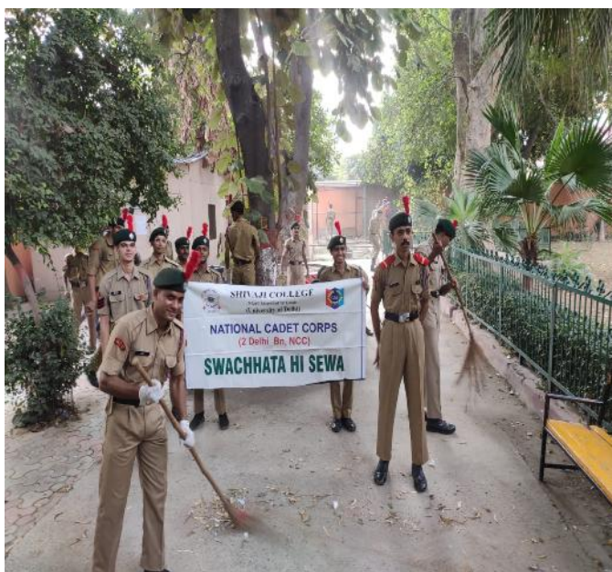
Young Cadets on a Cleanup Drive: Swachhta Rally, NCC

Cadets of Shivaji College NCC took part in Swachhta Rally on October 2, 2019. The motive was to spread the message of sanitation in our society. Cadets vocalised slogans on the importance of swachhta and also used handmade slogan hoardings to spread awareness. The cadets also carried out an Anti Littering Drive, where they collected litter strewn around the college campus.