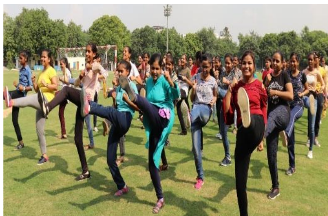
Raised to Fight Injustice: Self Defence Workshop by the WDC

On November 1, 2019, WDC organised a Gender Sensitisation Programme to make students aware of modern day issues of gender