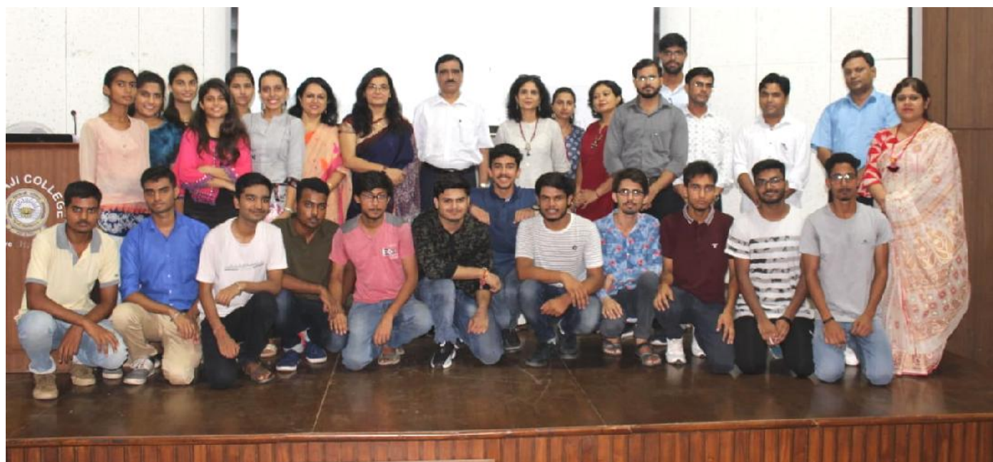
Celebration and Plantation on Teacher's Day

On Teacher's Day, the Department of Mathematics participated in "Plantation Drive" organised by the Garden Committee.