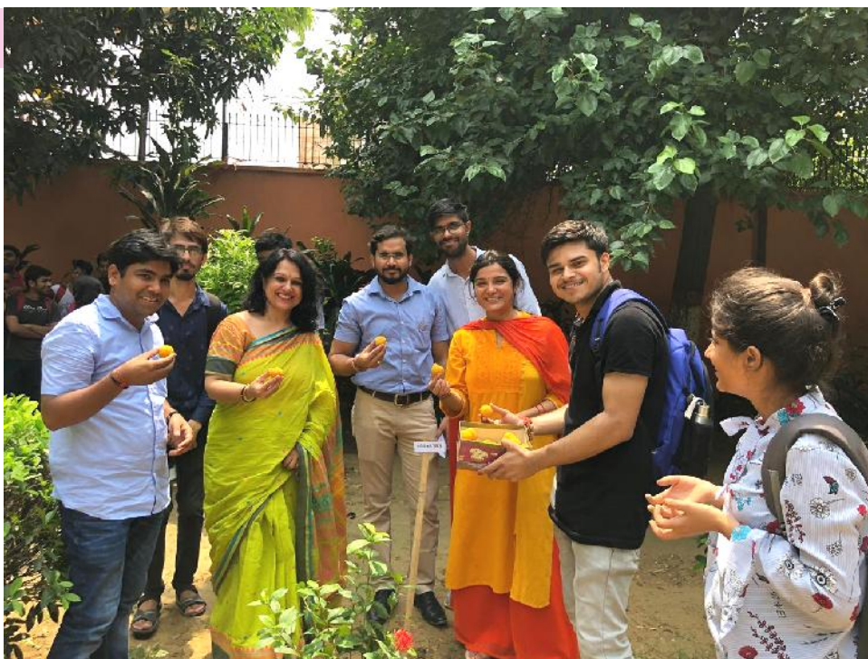
Resource Person, Faculty and Volunteers during Seminar on 'Development of Mathematics through Generations'