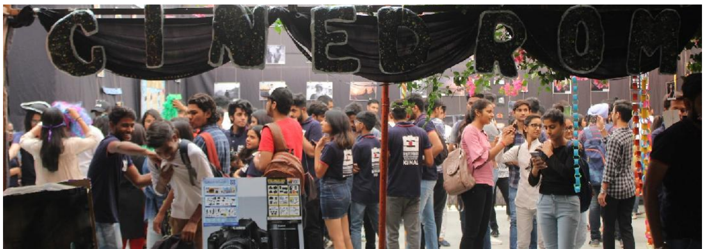
The Campus Comes Alive with Cinedrome

Cinedrome witnessed enthusiasm in the field of photography in competitions such as 'Click-Clock', 'Luminum', 'Abstract' and 'Strange Things', and 'Syaahi'.