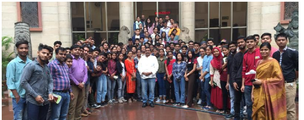
Combining History with Fun: National Museum Tour, Department of History

Students of BA (H) History I, II and III year were taken to the National Museum for an academic tour on November 7, 2019.