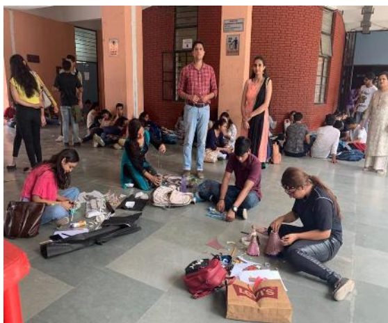
Slogan Writing Competition: NSS