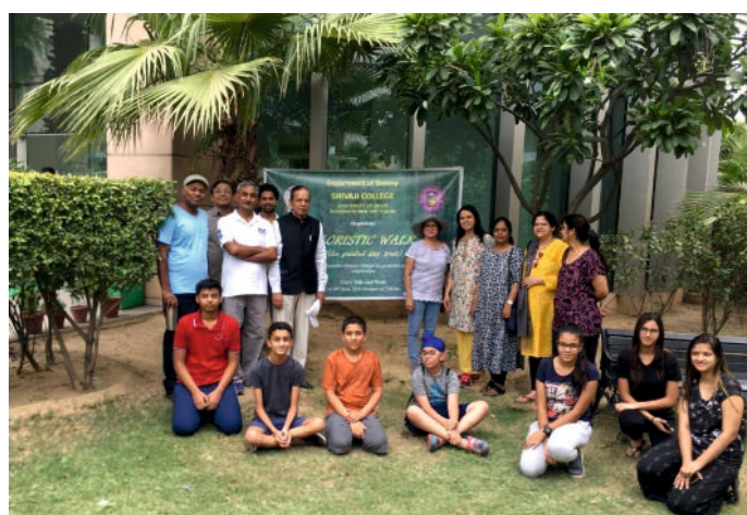
'Floristic Walk' organised by Department of Botany

The Department of Botany organised a “Floristic Walk” on June 30, 2019, in the Commonwealth Games Village, Patparganj, New Delhi, where the faculty members of the Botany Department along with the officials of Commonwealth Village discussed the flora and fauna along the walk.