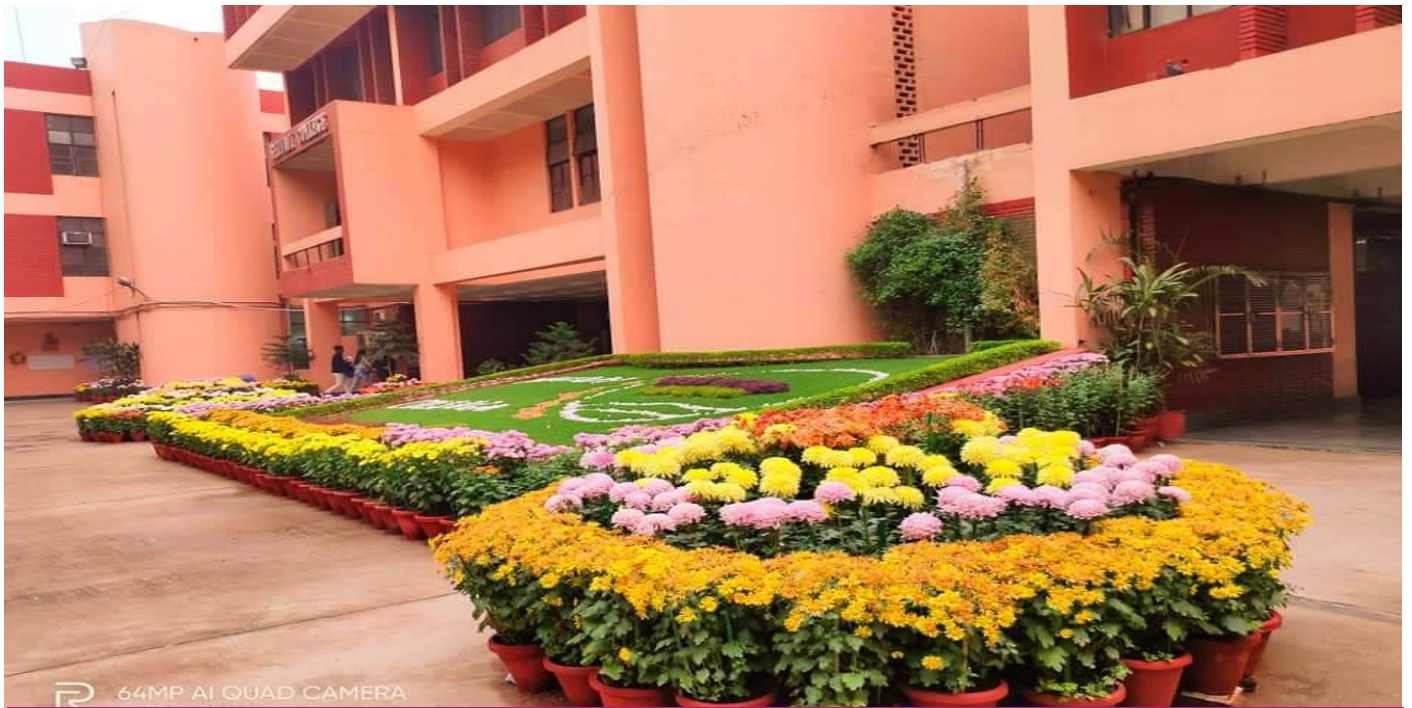
Knowledge Amongst Nature