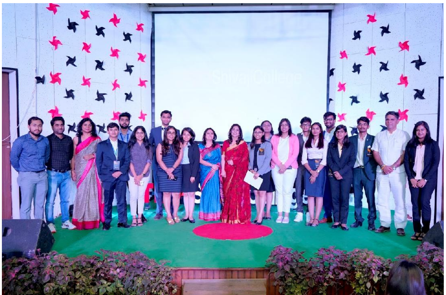
Ideas Can Change Attitudes: TedX Talks at Shivaji College