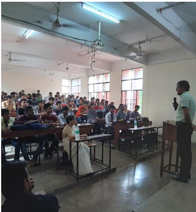
Absorbed in the Talk by Khan Study Group

The Department of Geography organised two workshops on civil service preparation and career orientation on September 4, 2019. The first workshop was by Times Group and the second was by Khan Study Group (KSG). An audience of approximately 150 under-graduate students and faculty members from Geography, Environmental Studies and various departments participated in the workshop.