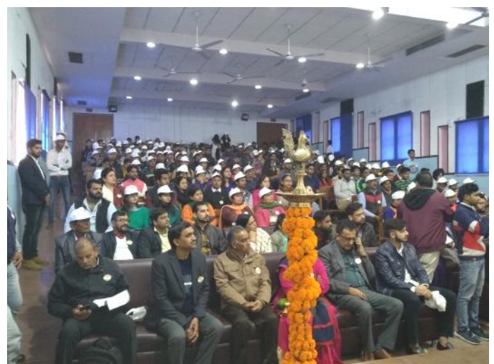
The Audience at the National Voter's Day