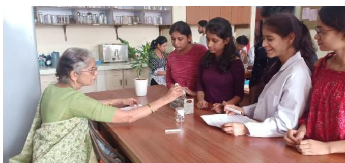
Workshop on 'Plant Physiology'