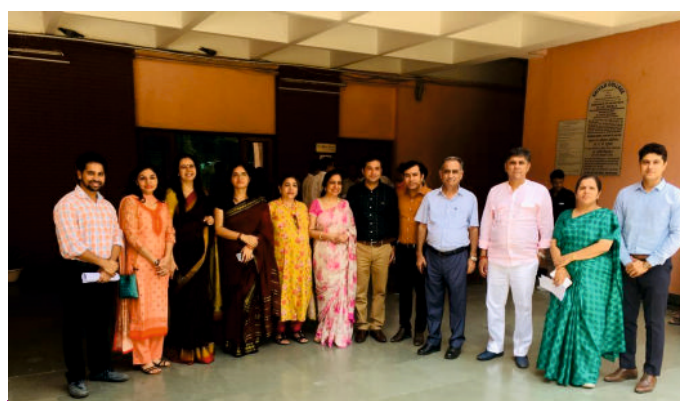
Dignitaries on the Inaugural Day of the Faculty Development Program on 'Biomathematics'

The Department of Botany along with the Department of Mathematics, Shivaji College, organised a Faculty Development Program (FDP) on Biomathematics from August 1-7, 2019, in collaboration with Mahatma Hansraj Faculty Development Center (MHRFDC), Hansraj College, University of Delhi, under the scheme Pandit Madan Mohan Malaviya National Mission on Teachers and Teaching, Ministry of Human Resource Development, Govt. of India. The FDP motivated the participants for research and innovation in the emerging areas of Biomathematics.