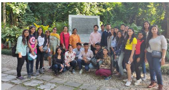
Outstation Trip to Chakrata and Dharmashala