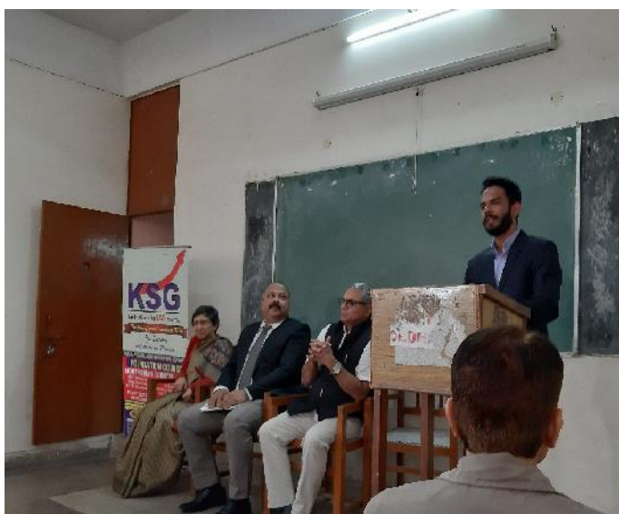
Workshop by Civil Services Times Group