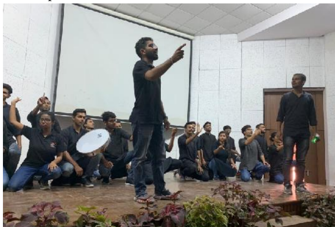
Social Change through Theatre: Nukkad Naatak