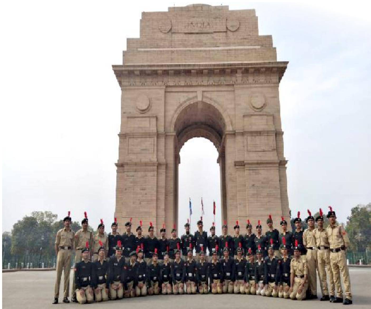
NCC Cadets Stand in Pride