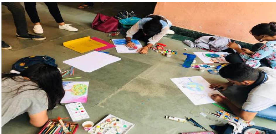
Poster Making Competition

NSS organised a poster making competition on September 5, 2019, under the Swachhta Pakhwada Programme of the Government of India. The topic for the posters was "Say No to Plastic".