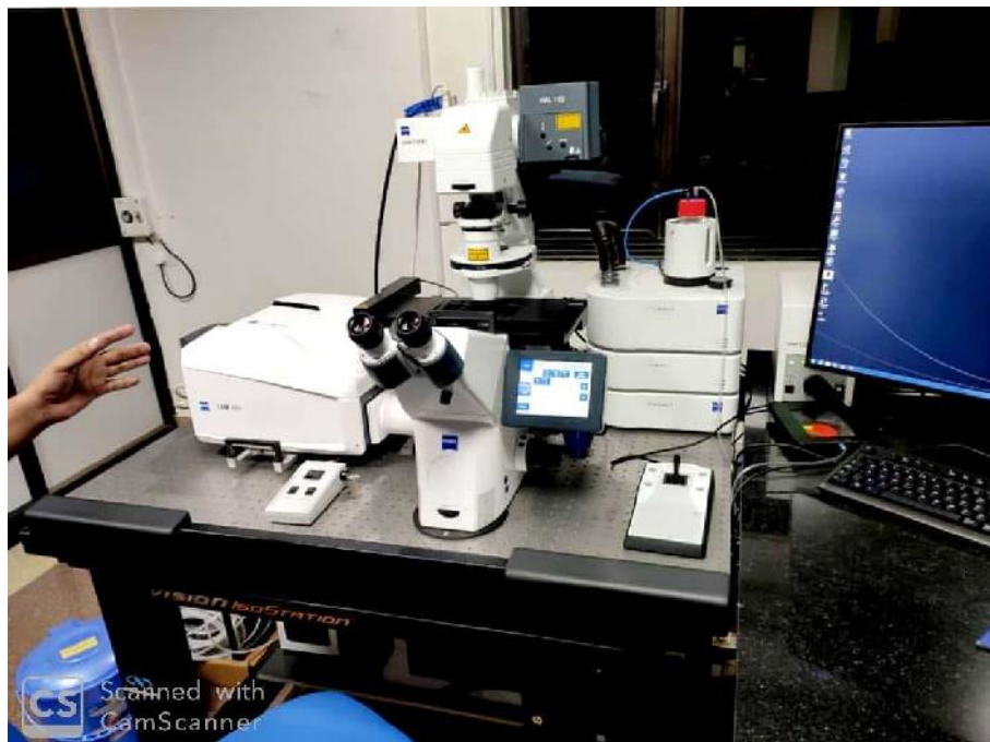
Laser Scanning Confocal Microscope

A group of 25 students along with four faculty members went to Regional Centre for Biotechnology (RCB), Faridabad on October 16, 2019. It was a full day visit. Students were given a lot of exposure to various instruments and devices such as Optical Microscope, Electron Microscope, Light Scattering Device, DNA Analyzer, Laser Scanning Confocal Microscope and Bioreactor.