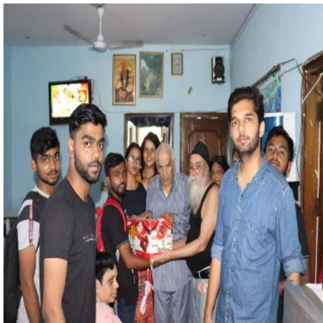
Visit to Old Age Home