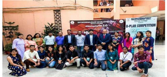
Young Entrepreneurs: Events Held Under Aegis of the EDC