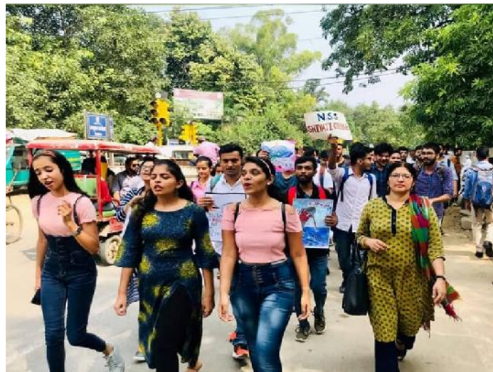
March against Plastic

The Golden Jubilee of NSS was observed on September 24, 2019, by organising 'Slogan Writing Competition', 'Debate', and 'Best out of Waste Competition' as a part of the celebration.