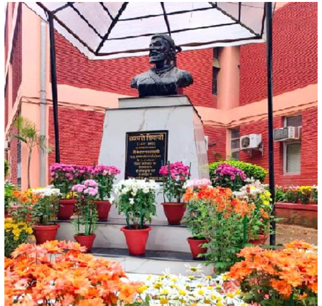
Warrior Values Carried On...