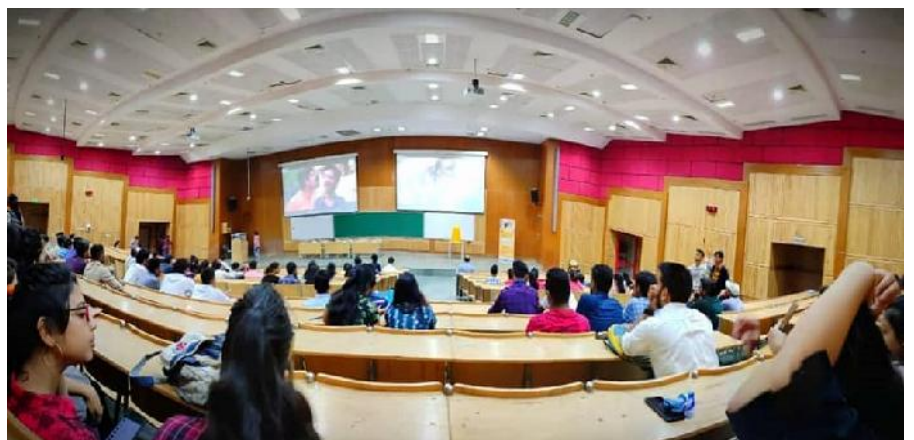
iSAFE'19 – Road Safety Initiative Programme

iSAFE'19 – Safer India Challenge is a road safety initiative run by Indian Road Safety Campaign and Ministry of Road Transport and Highways. The campaign aims to reduce the deaths caused due to road accidents to half by 2020.