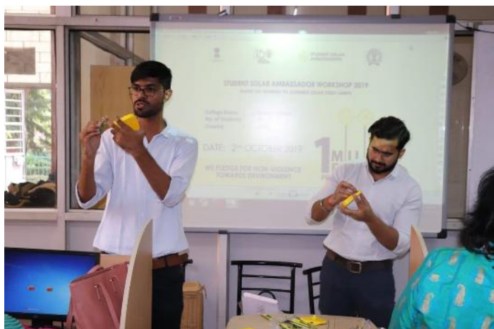
Solar Lamp Making