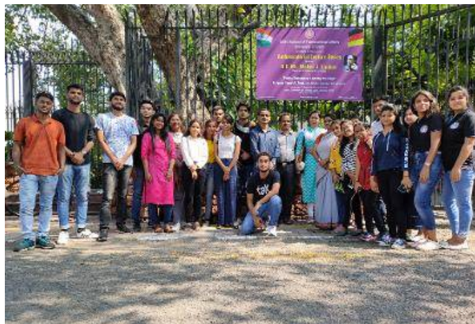
Trip to Ambassadorial Lecture Series

The Department of Political Science observed Constitution Day in the college on November 8, 2019, to spread awareness among the students regarding the importance of the Constitution in nation-building. It also celebrated Independence Day in the College on August 16, 2019. A quiz competition among the students on the theme of India's Freedom Struggle was also conducted to mark the occasion.