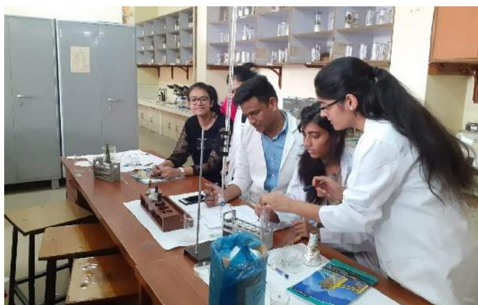
Workshop on 'Plant Physiology'