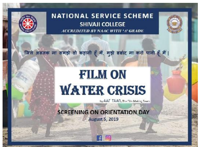
Film Screening by NSS