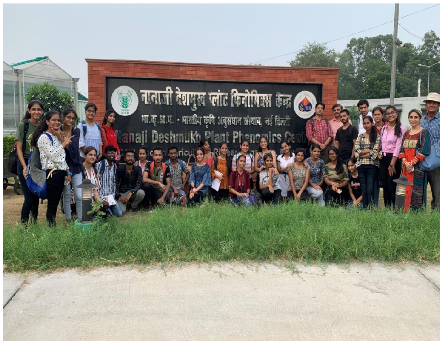
B.Sc(Hons) Chemistry Students at the Phenomics Centre