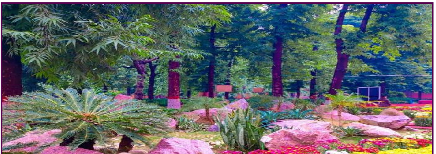
Rock Garden at its Blooming Best