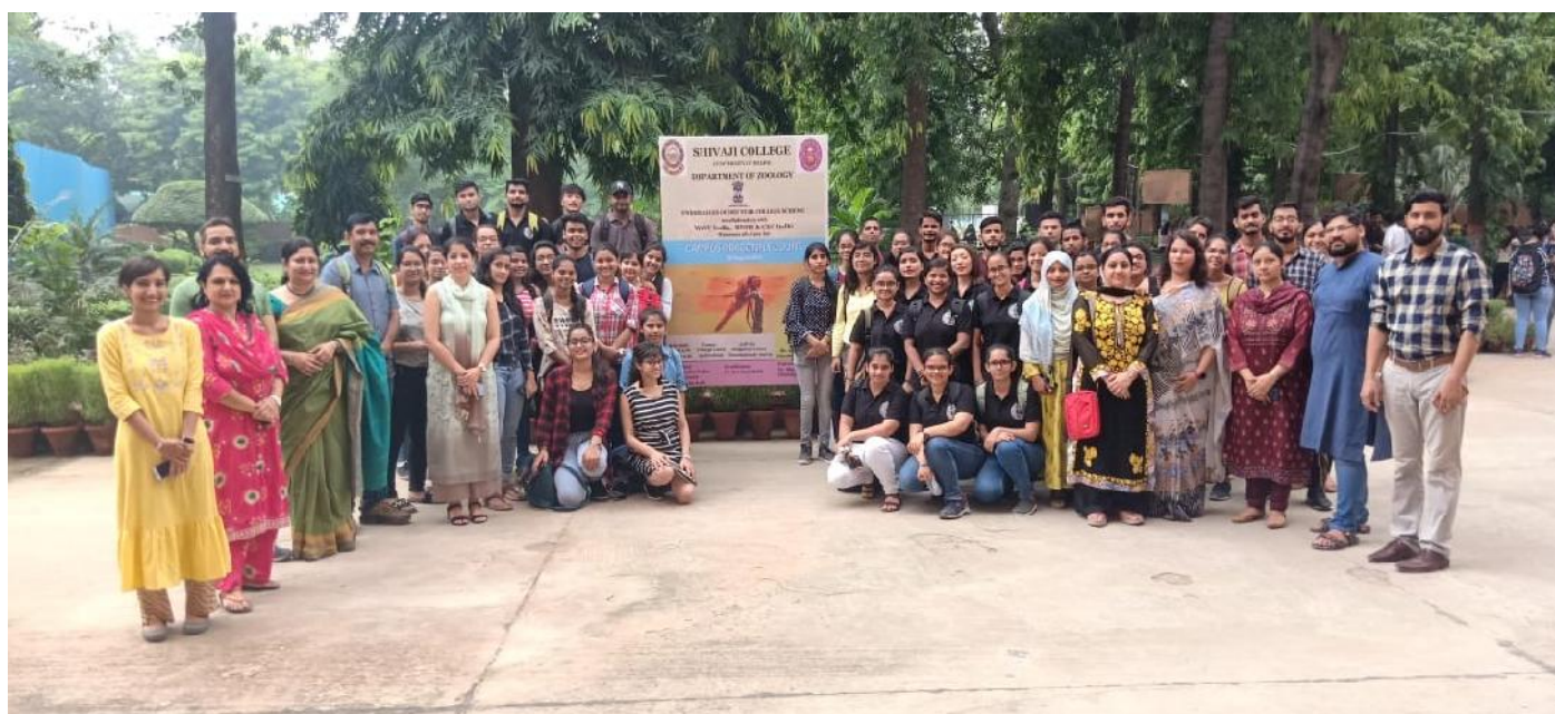
Campus Dragonfly Count: Department of Zoology

Inter College Lab Skill Training Programme organised at Shivaji College under DBT Star College Scheme from November 27- December 3, 2019.