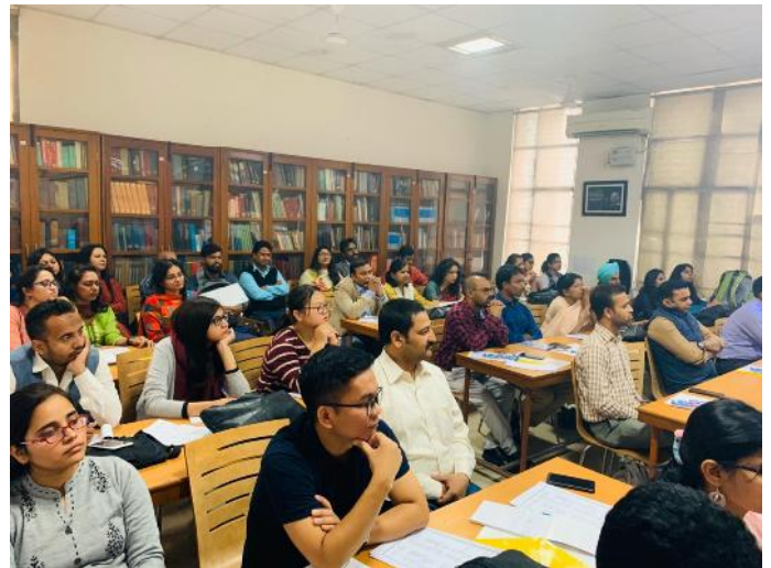
FDP on 'Research Methodology and Data Analysis'

The Department of Commerce in collaboration with Indian Business School (IBS) organised mock tests online and offline on September 30, 2019. These tests were on the pattern of management entrance exams.