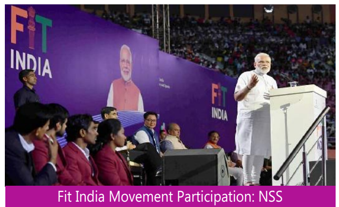
Fit India Movement Participation: NSS

NSS organised a poster making competition on September 5, 2019, under the Swachhta Pakhwada Programme of the Government of India. The topic for the posters was "Say No to Plastic".