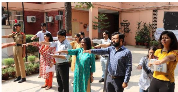
In Celebration of Gandhi Jayanti