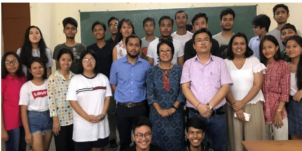
North-East Counselling Cell Orientation Programme

observing academic rigor and discipline even as they make the most of their three years study in the college. Students from the older batch also shared their experience in the college and beyond.