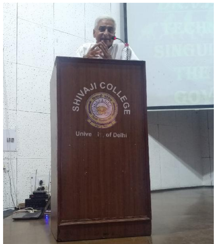
Talk by Dr. V.P.S Malik: UN Day

The National Voters' Day was celebrated by the Department of Political Science in collaboration with the Election Commission of India (Zonal Office) on Jan 25, 2019, in the College Auditorium.