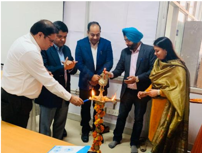
Lighting of the Lamp: Faculty Development Programme