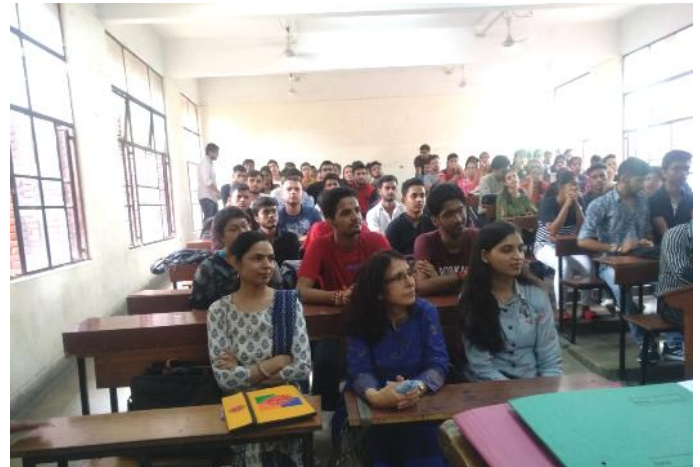
Lecture on Independence Day Celebration