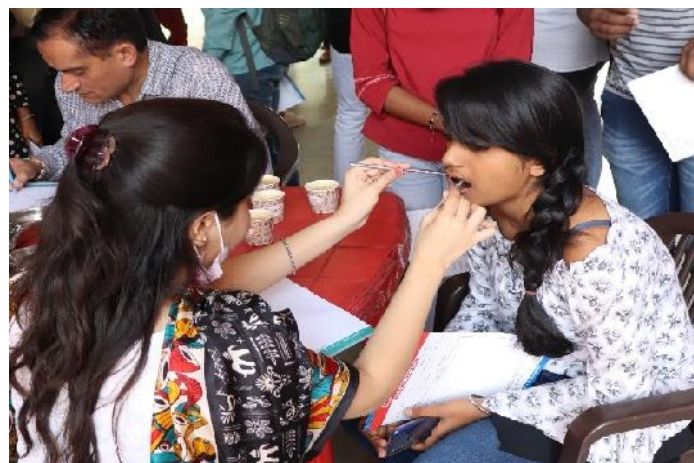
Health Camp by NSS