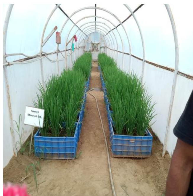
Let's Preserve the Greens: CESCRA Lab Visit