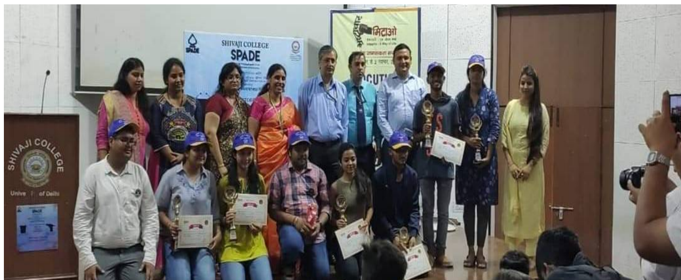
Vigilance Awareness Week: Spade