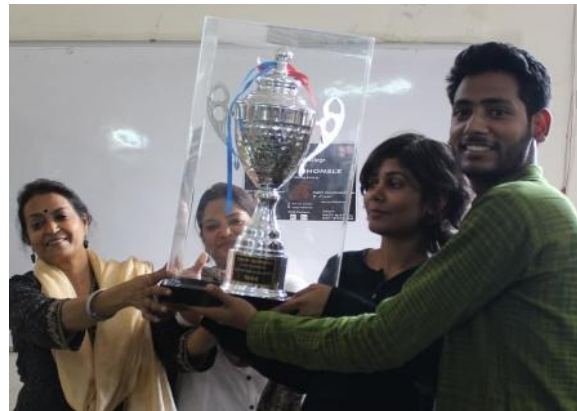
The Victory of Healthy Dialogue: Dictum Debate

The motion for the debate was "This House prioritizes the economic aspect of the scrapping of 'Article 370' over the emotional aspect of it, while judging it".